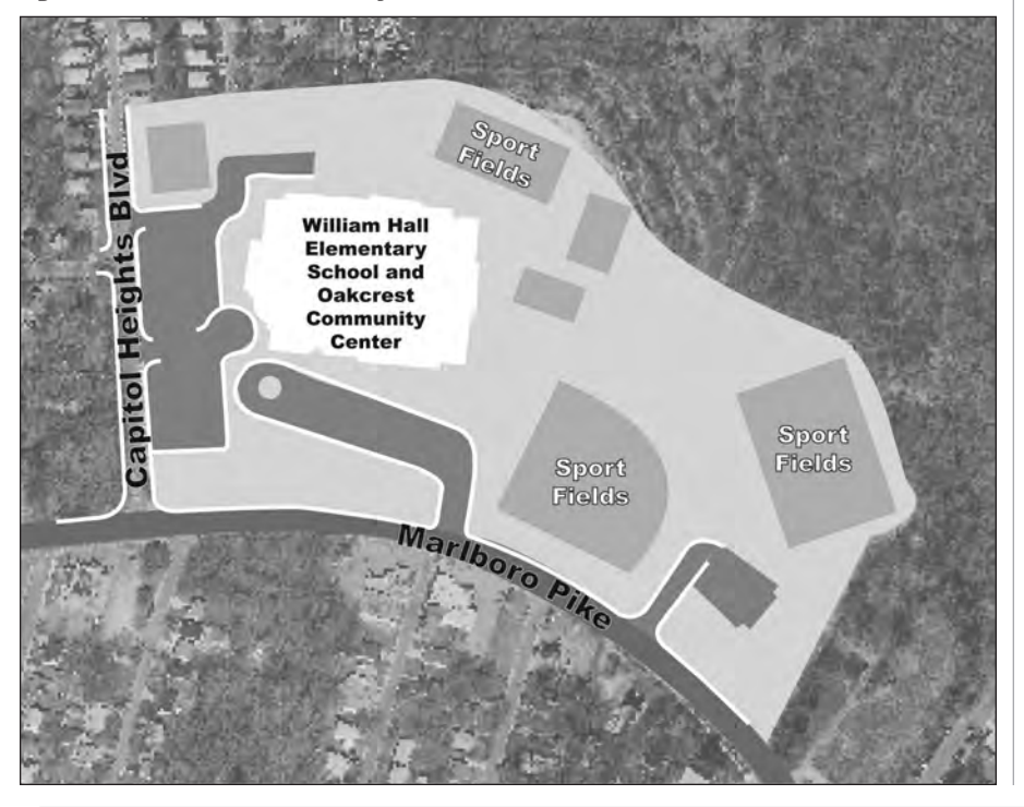
Figure VI-3: Oakcrest Community Park Plan

Although there are some opportunities for recreation, they are limited, especially for the area's youth. Additional recreational opportunities and programs are strongly desired, including bicycle trails and green community spaces.